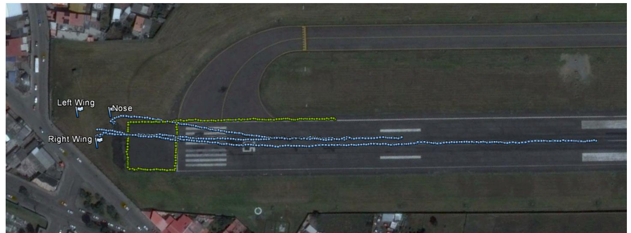
Figure 2 - Recorded GPS tracking along the runway threshold used as reference for calibration